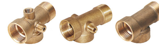
5TA 5TB 3TA